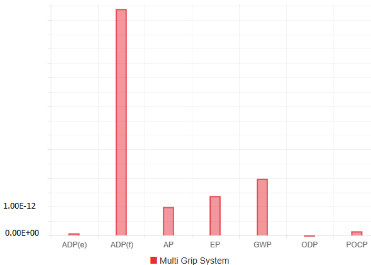
Figure 1: Normalization of the AC Multi-Grip System on the reference area Europe

The results – resource use – show that the use of non-renewable primary energy resources is dominating over the use of renewable primary energy resources in all analysed phases. The analysed waste categories show that most of the occurring waste is non-hazardous waste.